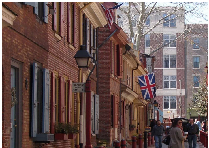
Main Street conference visitors tour one of Philadelphia's oldest residential streets

This year's conference theme was "Diversity and Entrepreneurship." Twenty-seven people representing 11 Missouri towns attended the conference: Cape Girardeau, Chillicothe, Clinton, Liberty, Louisiana, Lee's Summit, Sikeston, Warsaw, Warrensburg, Washington and Wentzville. Everyone gathered lots of information and ideas to take home from conference workshops and tours of Philadelphia's historic neighborhoods. Continued page 2