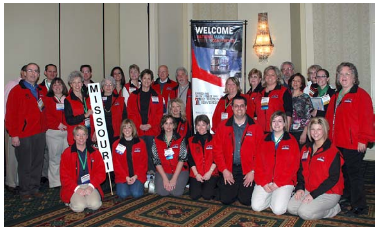
Missouri representatives at the National Main Street Conference enjoyed their visit to Philadelphia and gained new skills to help their organizations perform to higher standards

organizations such as the International Downtown Association (IDA), the Local Initiative Support Corporation (LISC). The result will be a directory and catalogue of preservation materials.